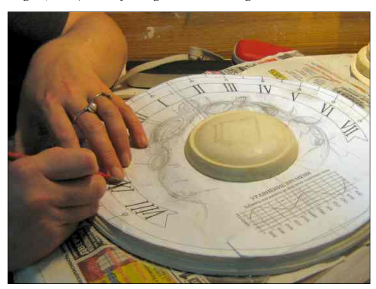
Fig. 2(below). Transferring the dial drawing.

Two worlds, the earthly and celestial, are united in a sundial. I think that there is no more suitable subject to express the universe in a small object as a sundial. Unlike physicists and philosophers, I am freer to chose the method of analysis. I think that a sundial is the best subject to realize the entity of time by means of the artistic method.