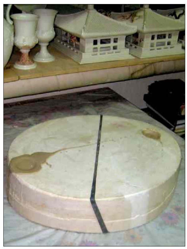
Fig. 1. Mould with two funnel-shaped holes.

The pottery which we produce results from casting the slurry into a mould. The mould is a 3D mirror image of the resulting product. Commonly, a mould consists of three or more parts. But the form of a round dial is very simple and we have used a mould consisting of only two parts: an up-