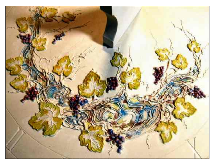
Fig.\ 8\ (above).\ The\ first\ stage\ of\ painting\ (unfired).