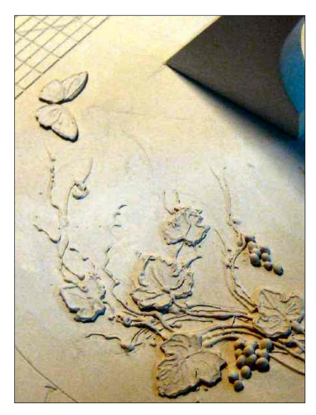
Fig. 7. A butterfly as a central feature of the composition.

"Now it is time to make a decision on the gnomon. We can measure time but we do not really understand what it is that we measure. Time is just a philosophical abstraction. So let this abstraction be very simple and let it be devoid of decoration." (See Fig. 6.)