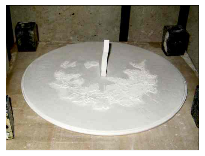
Fig. 9. The enamelled dial is ready for firing in a kiln.

The paints (glazes) we use are oxides and salts of cobalt, nickel, chromium, titanium, iron and gold. The shades of colour depend on the concentration of the compound, the thickness of the colouring layer and on the firing conditions. To achieve the additive affect we usually mix the paints or apply them layer by layer. The final colour of such a mixture is not predictable to a high degree of accuracy. But the properties of pure compounds are well known. For example, the salts of nickel give a shade of beige. The compounds of chromium give shades of green. The neutral solution of nitrohydrochloric gold gives very nice rose colour. Fig. 8 shows how the dial looks after the first layer of paint is applied.