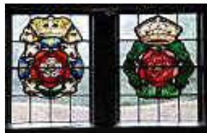
Tudor Rose with